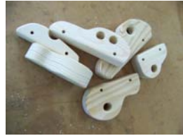
If you're making cars, bore holes for the axles and windows.